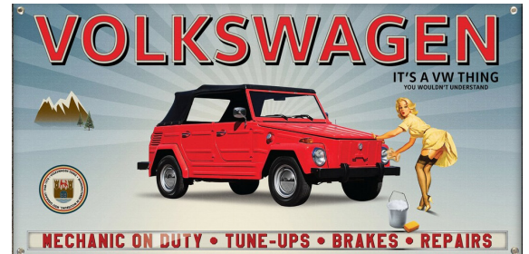
Metal Garage Sign